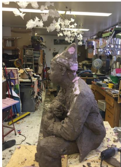
The figures gradually develop