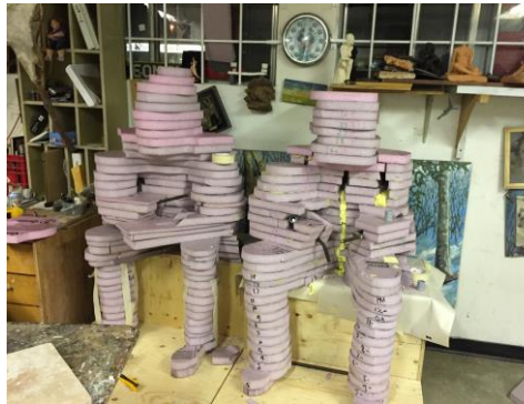
... roughing out the form in styrofoam