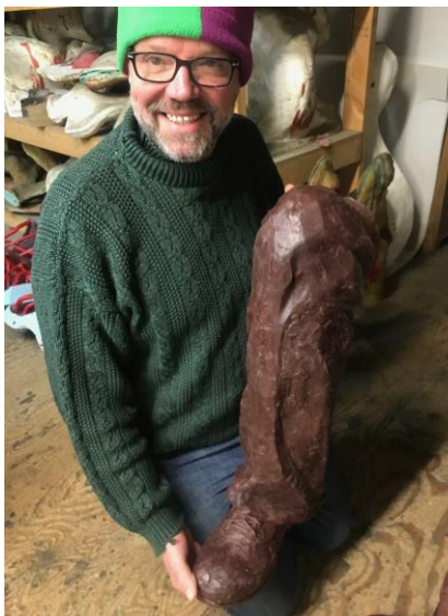
Molded wax pieces prepared for bronze process