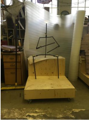
First the armature...