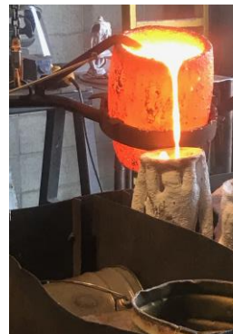
Pouring the bronze