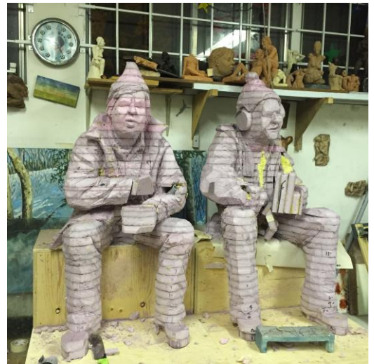
...the figures take shape