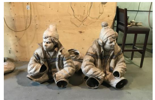
... putting them all back together in bronze