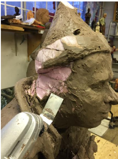
Sculpting the plastiline