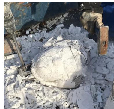
Breaking ceramic shell mold