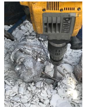
Extracting bronze from mold