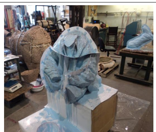
The figures are disassembled for molding