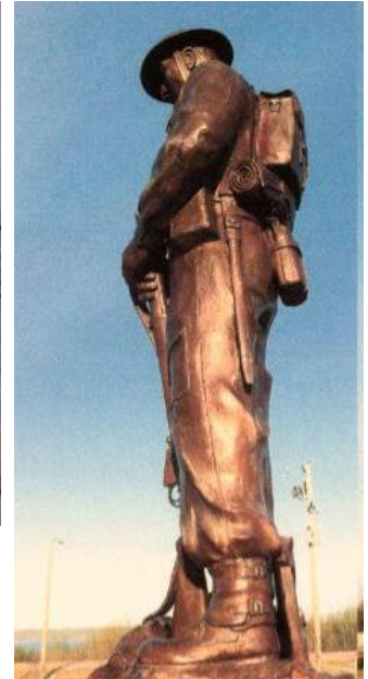
Right - Fishing Lake War Memorial