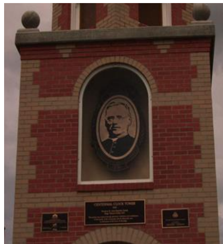
Centennial Clock Tower, Morinville

Unscheduled hours - early morning when the world sleeps - is the best of times.