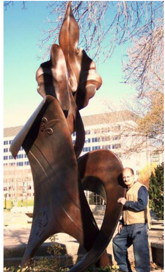
Francophone Bronze, Alberta Legislature Grounds

Seeing a child show you his own creativity in any