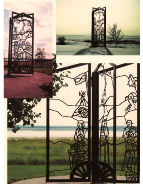
St. Paul Metis Monument

cast, transport, install. such monuments. The collaborative support and knowledge of the team is so essential for such endeavours.