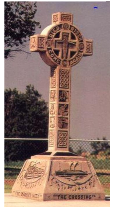
Celtic Cross Monument

The word "our " above refers to team effort needed to research,