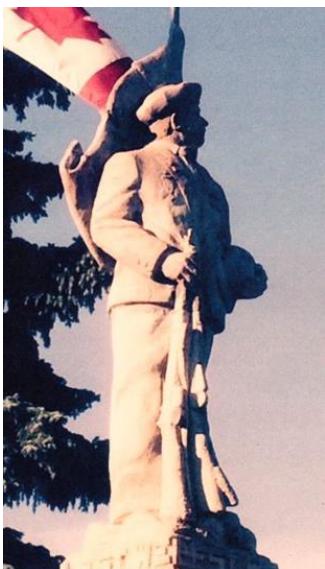
Elk Point Memorial