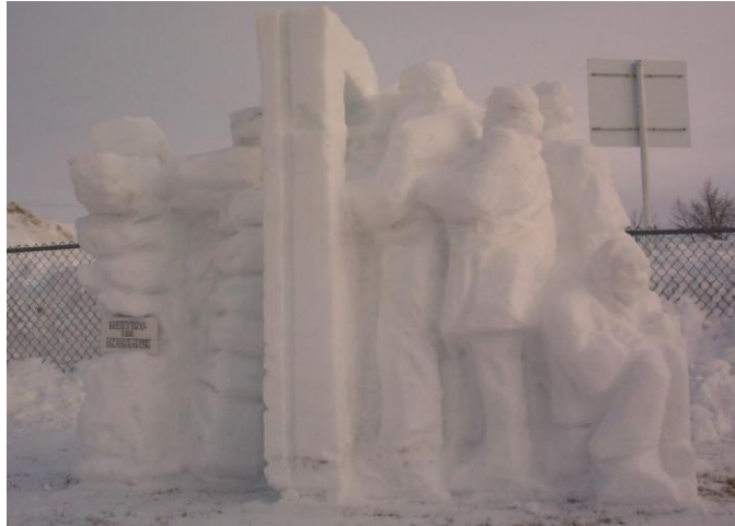
Above – Meet the Inukshuks