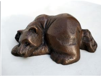
Cold cast bronze