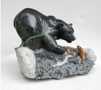
One Scoop or Two