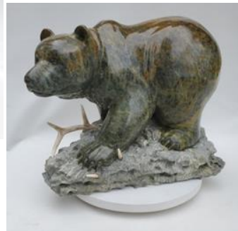
The Cover Up