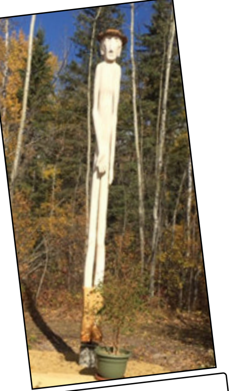
"Joe" by Laval Bergeron

I've sculpted a lot of snow, this is a first for wood or any other medium or material!