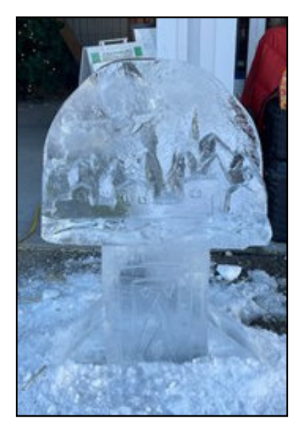
Landscape Randall Fraser Moyer Rec Centre