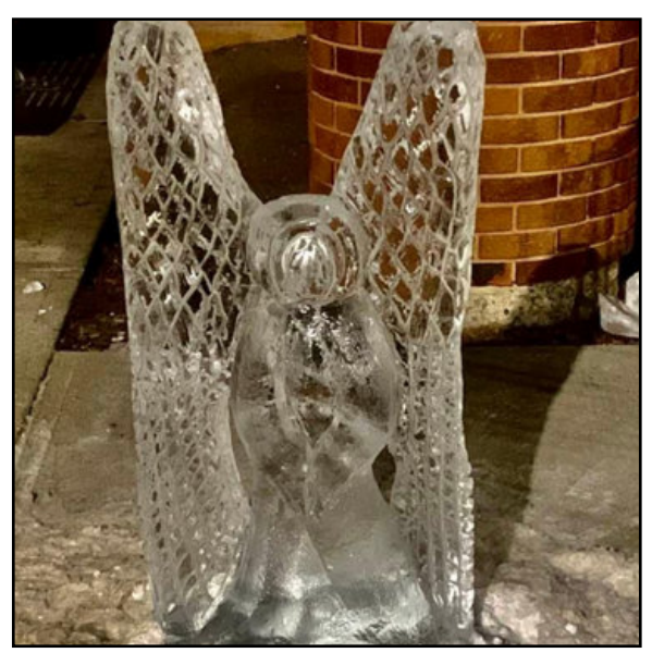
Angel Ritchie Velthuis