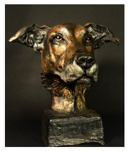
Dash - dog portrait