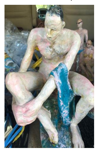
The Bather (circa 2014)