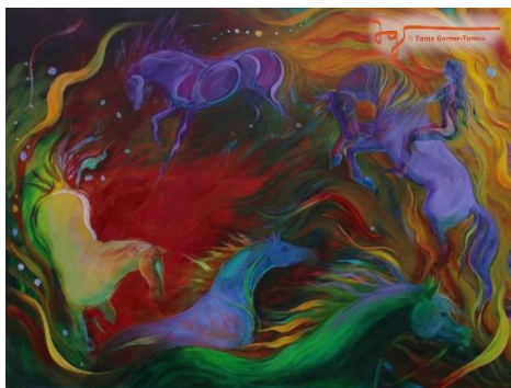
Candy Sweet Moments 48" x 36" Acrylic on canvas