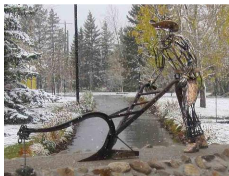
The Ploughman, Stone Barn Park, Leduc Alberta