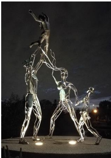
Spirit of the Future Stainless steel with hammered bronze with cast hands, face and feet 11'9" tall Broadmoor Lake Park, Sherwood Park