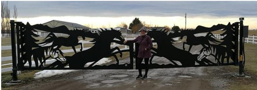
Vantage Trailers gate 24' x 5' Mild steel, zinc primed, powder coated Lethbridge, Alberta