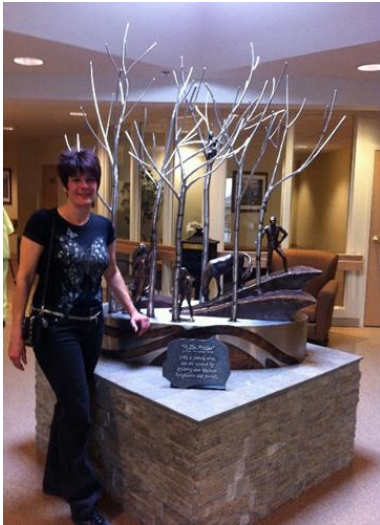
In the Birches Silver Birch Lodge, Sherwood Park 6' x 4' Stainless steel and bronze