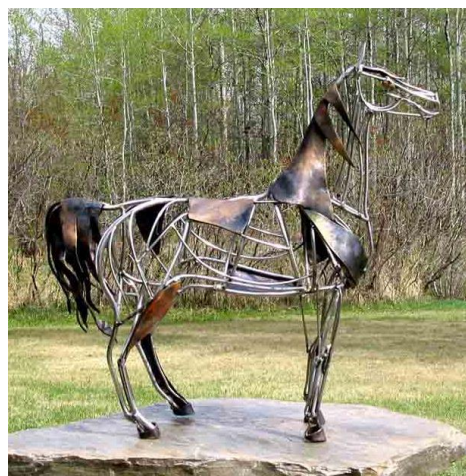
Portrait of Slicker Stainless steel and bronze 16" tall