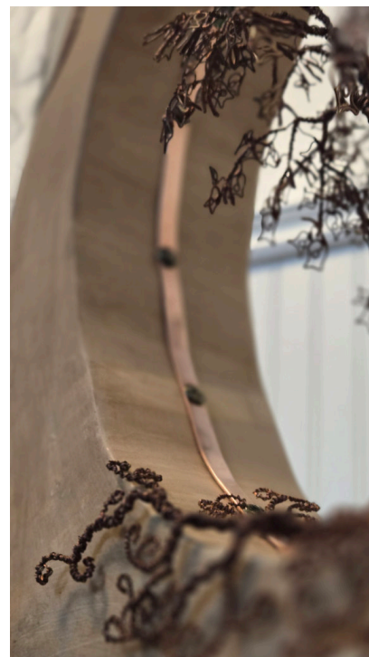
Member Jake Vanderwerf is just wrapping up his latest copper wire sculpture - a memorial piece of a birch tree with seaglass, framed in a birch round cutout.